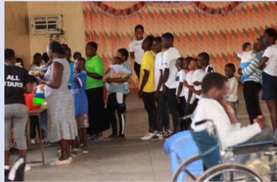
Participant sharing meal at the event