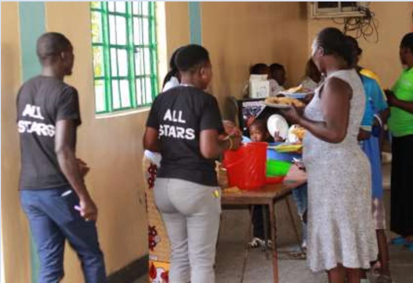
Team serving meal