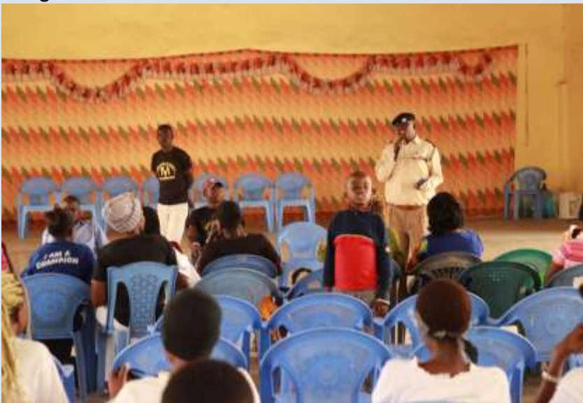
Area Chief inaugurating the occasion