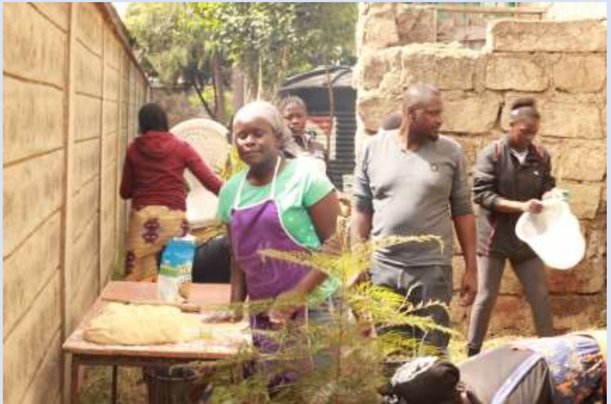
Team preparing meal