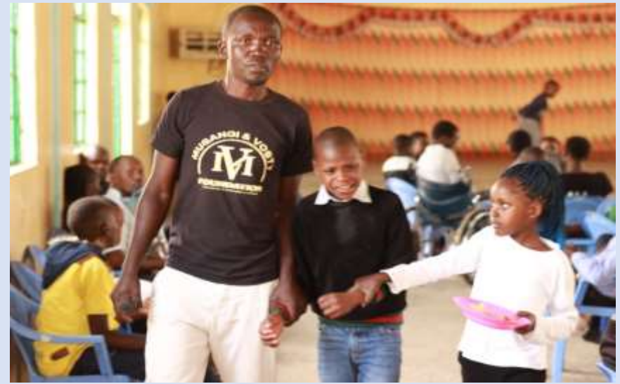
Sharing good time with the kids and caregivers