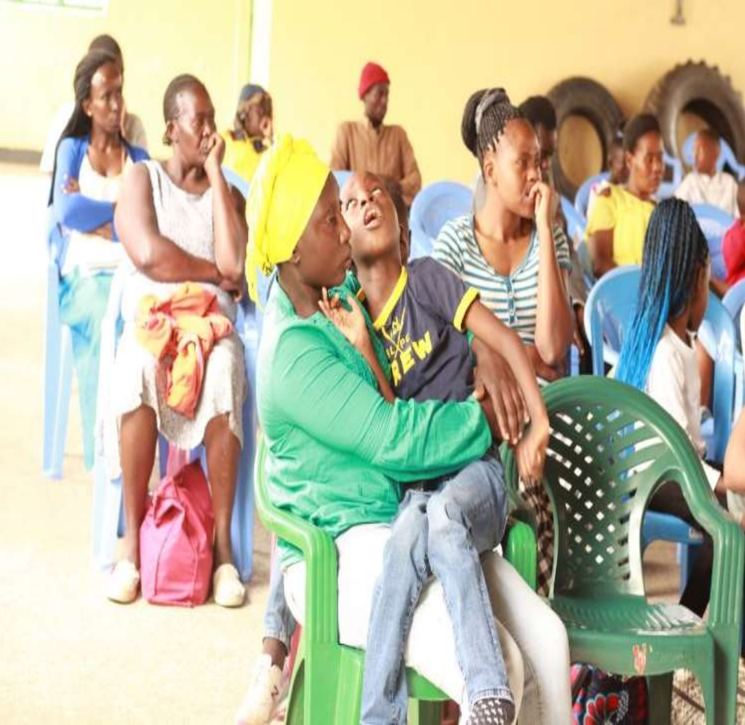
VENUE SOWETO SOCIAL HALL